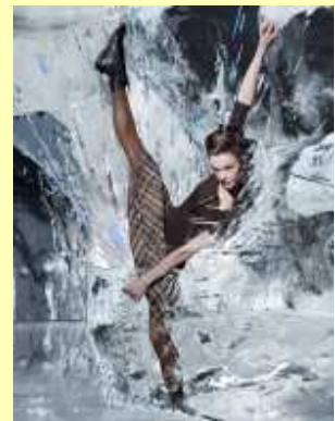
The Eifman Ballet of St. Petersburg Onegin May 14-17