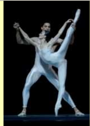
The Joffrey Ballet Spring Program April 29 - May 10

Don't miss the dynamic and dazzling Giordano Jazz Dance Chicago in their upcoming engagement at the Harris Theater for Music and Dance, March 13 and 14 at 8pm. Be there as this world class company