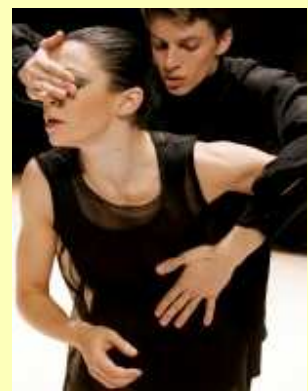
Nederlands Dans Theater I