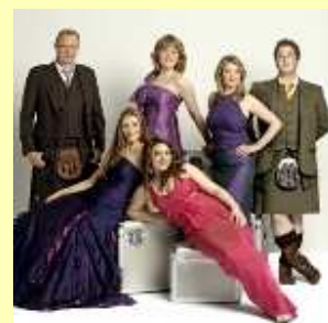
Highland Heartbeat September 4, 2009 on sale Friday, June 12