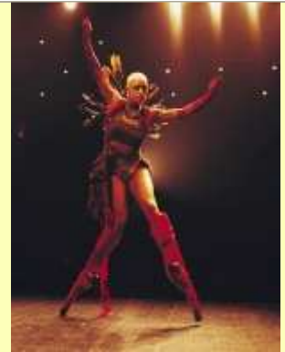
Batsheva Dance Company Deca Dance February 7 & 8

The program includes patriotic gems, including "The Battle