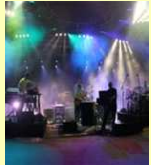
Umphey's McGee December 29-31, 2008