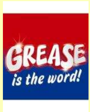
Grease January 6 - 18, 2009