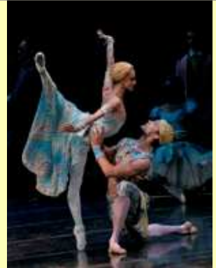
The Joffrey Ballet The Nutcracker December 18-28, 2008

Or invite your friends and family to join Alvin Ailey American Dance Theater's 50th anniversary celebration, April 1-5. Opening night includes a live performance by Sweet Honey In The Rock!